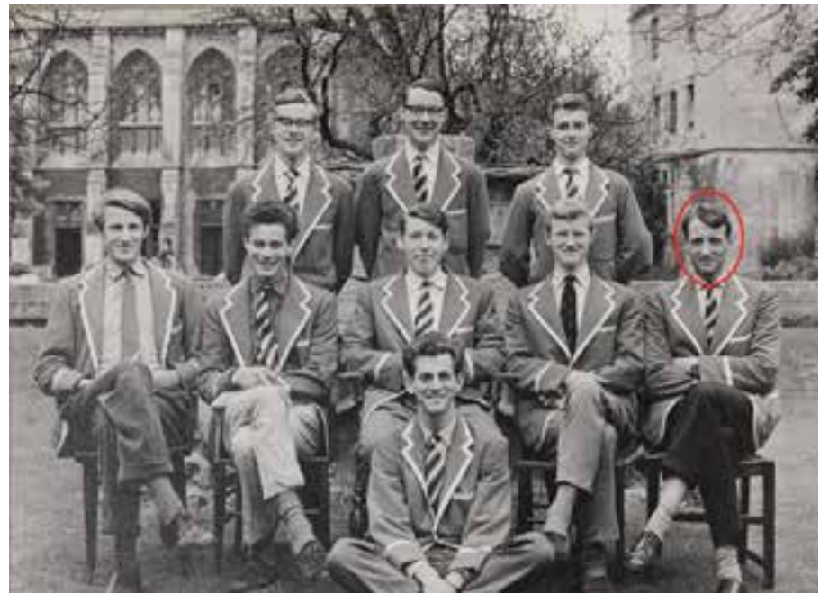
Prince Harald (circled), 'a formidable oarsman' with the Balliol College 1st VIII in 1962.

On one of these low key private visits, King Olav was chatting with the Master late in the evening when a threatening phone call was received. It was immediately obvious to the Master and the King that this was a hoax call from neighbouring Trinity College pranksters, and