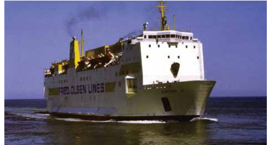
The less than elegant Borgen

The KDS route was so successful that in the 1980s the route was expanded to include both Hansholm in Denmark and Arendal, Stavanger