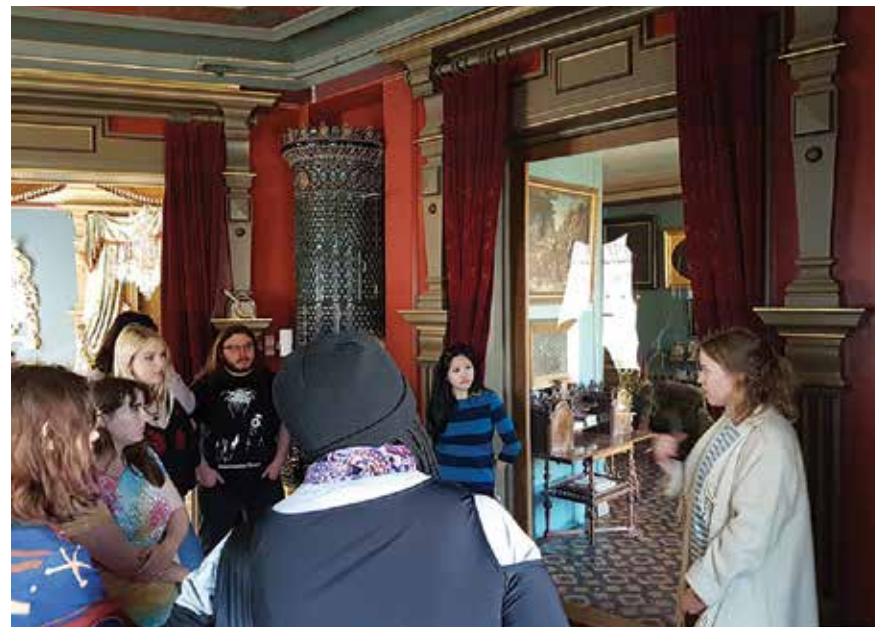
Inside Ibsenmuseet.