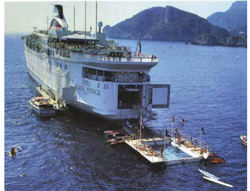
The Black Prince showing the marina floated out from her stern

base. After a brief but equally unhappy period as a ferry on the Copenhagen-Gothenburg route, she was put back on her Southampton to Canaries route in 1990, and later cruised very successfully to other destinations, quickly