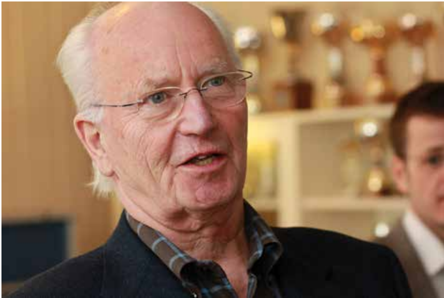
Thorvald Stoltenberg in 2011.

His career within the Labour Party was to show a steadily rising curve – State Secretary during the 1970s, then Defence Minister and finally Foreign Minister in the governments of Gro Harlem Brundtland in the 80s and 90s. His work, after a modest start as Vice Consul in San Francisco, also brought him prestigious diplomatic posts: Belgrade, Lagos, the United Nations. He was Norway's Ambassador to Denmark from 1996-99 and, as a humanitarian, served for three terms as President of the Norwegian Red Cross. But he was not destined to become Prime Minister, this was a position left for his son to achieve – twice!