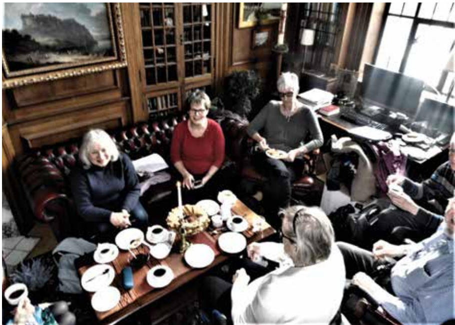
The writing group enjoying their coffee and waffles

Språk er et alvorlig emne. Det kan ha elementer av skam, av bryddhet og frustrasjon, likesåvel som glede. Det rører ved våre dypeste